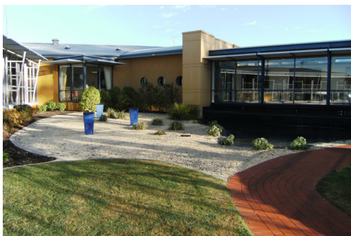
CMH Community Health Facility

Committed to providing quality primary care to the residents of Casterton & surrounding districts.